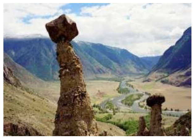
"Stone mushrooms" and Chulyshman River valley

Day 9 Transfer to the south of Lake Teletskoye. The road goes through the picturesque canyon of Chulyshman river, on the way stops a lot of photograph. Perfect views of the nearest Bashkaus river canyon. At afternoon arrival to the Refuges place on the shore of Lake Teletskoye. Day of rest on the refuge.