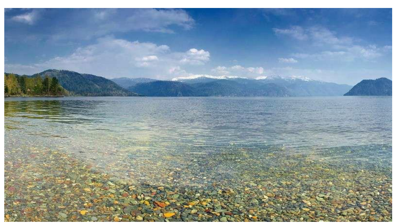
Teletskoye Lake, view from South field