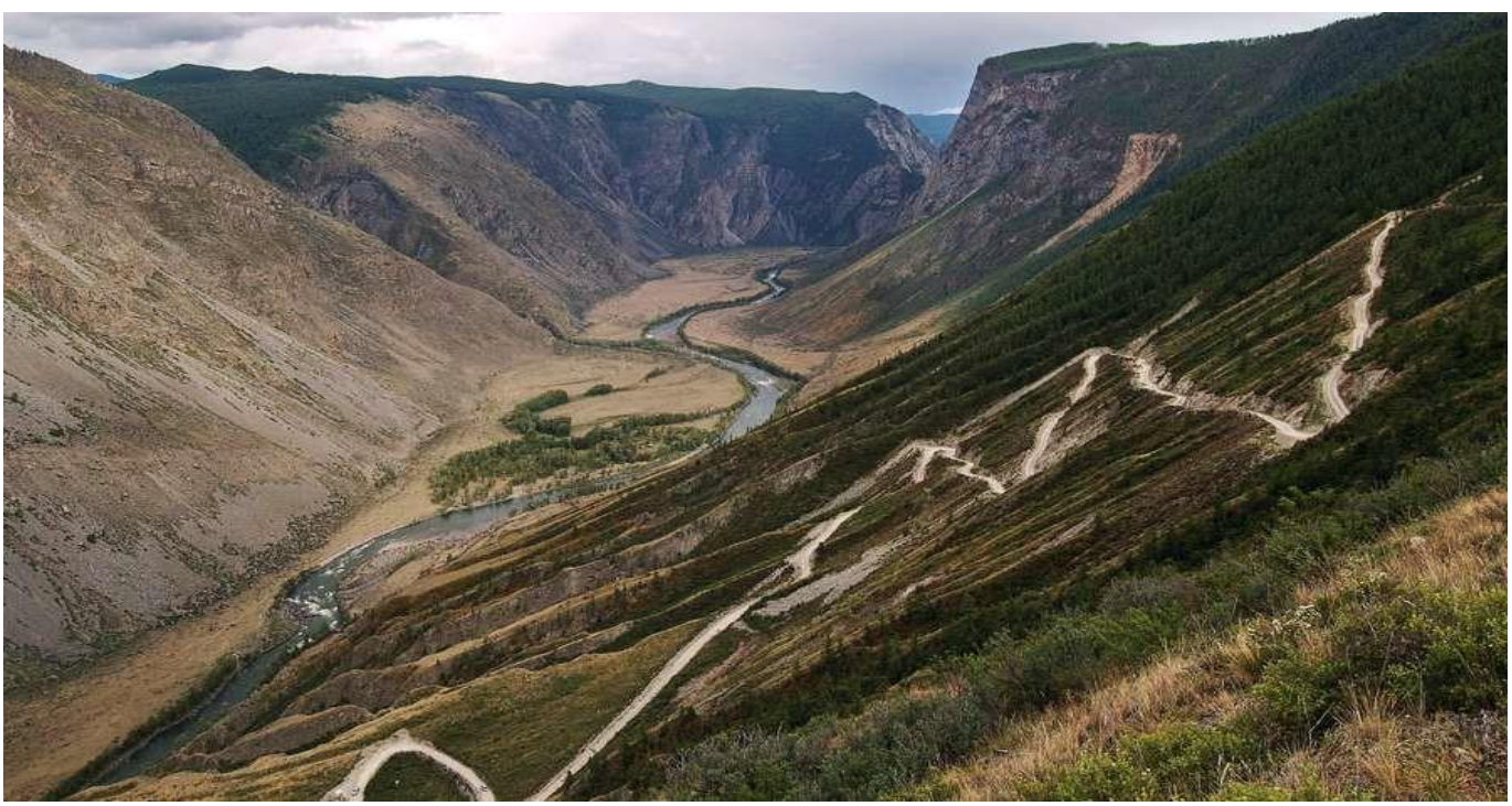
Katu-Yaryc Pass and Chulyshman River

Duration of the passages is 7-8 hours, 120 km.