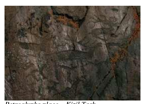
Petroglyphs place – Kizil Tash

Duration of the passages is 5-6 hours, 70 km.