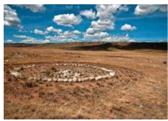
Burial mound in the Ukok