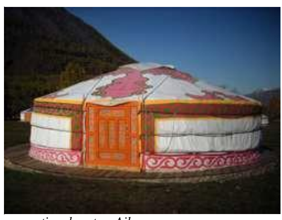
national yurts - Ail