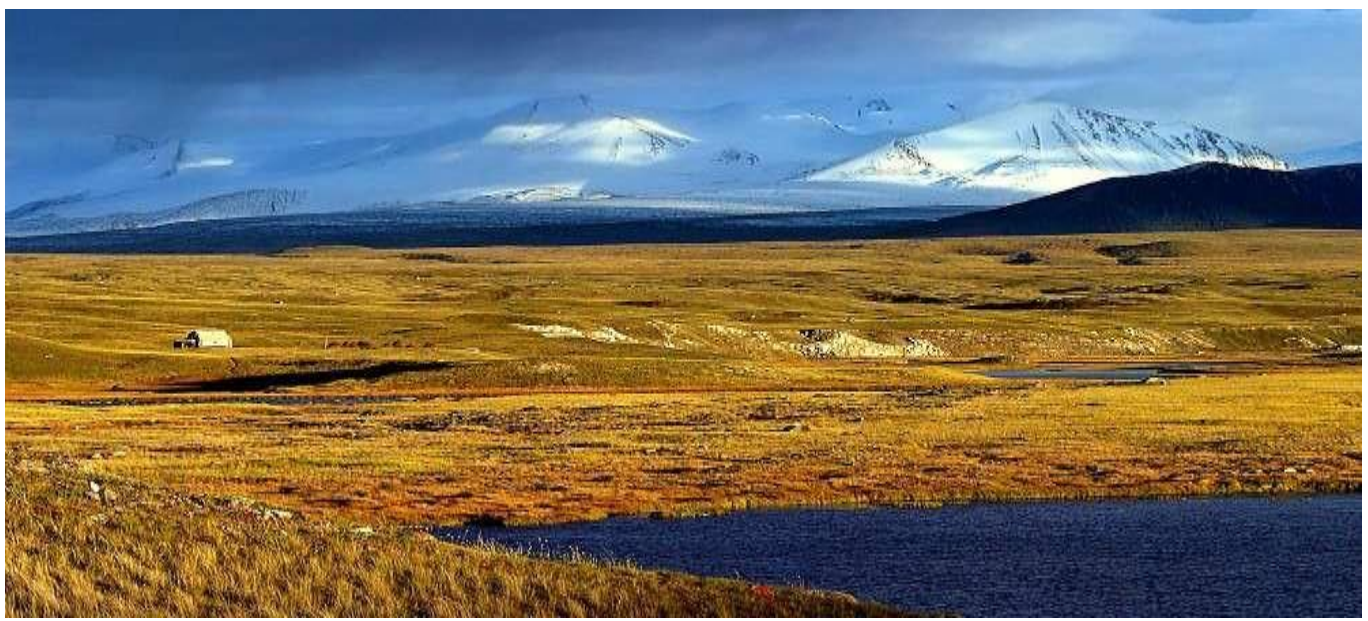
The ridge Taban-Bogda-Ola

11-days expedition (auto-trekking), Ukok plateau and Teleckoe Lake