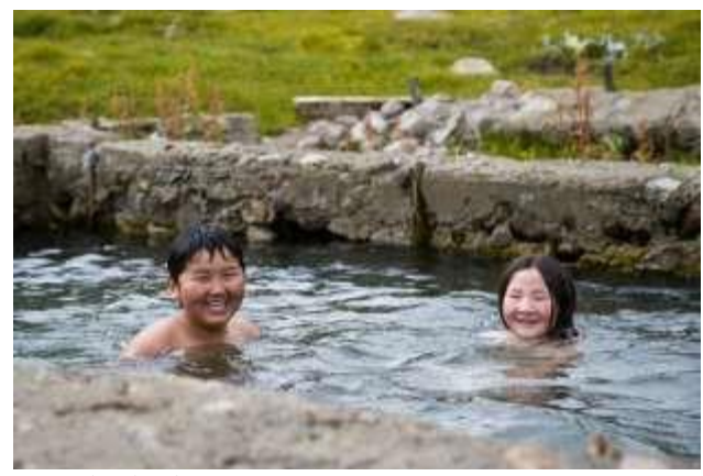
Djumalinskie hot spring

Day 3 Crossing one of the most difficult pass in this area with the highest point (2919m above sea level) - the Warm Key Pass. It's main place of interest of this point of a route. You will see amazing panoramas of the Sajljugem rigde and all Ukok Plateau. Accommodation in tents. Duration of the passages is 5-6 hours, 70 km.