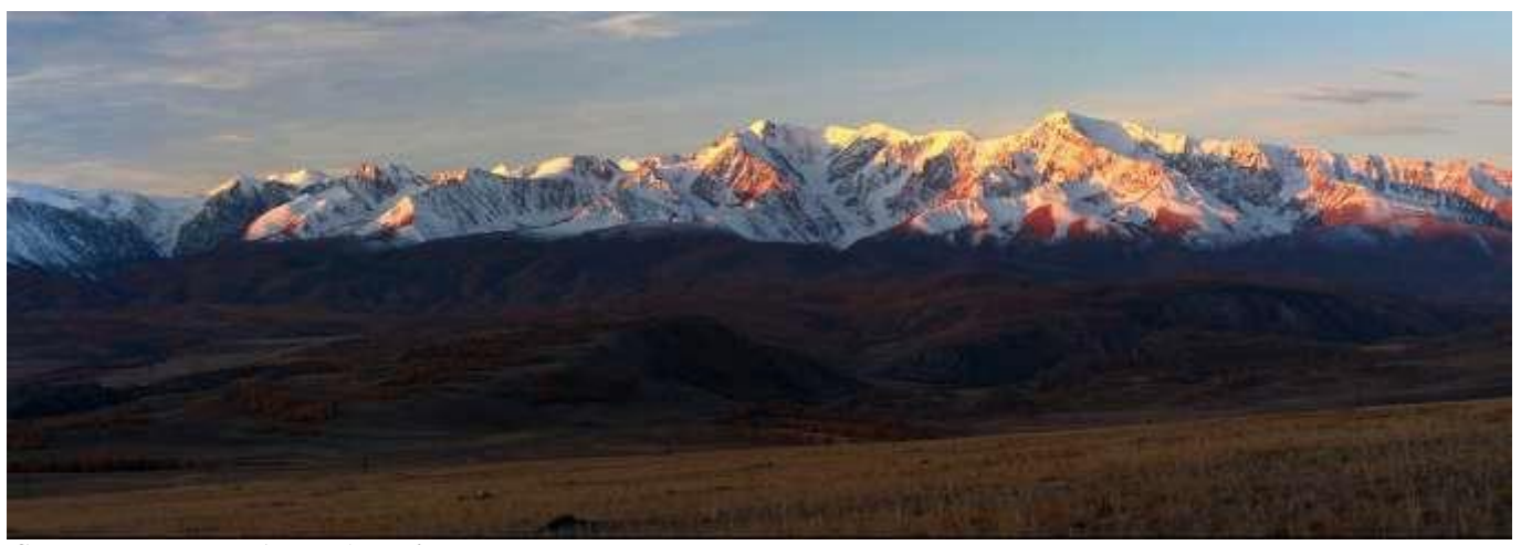
Северо-чуйский хребет, вид из Курайской степи

11-days expedition (auto-trekking), Ukok plateau and Teleckoe Lake