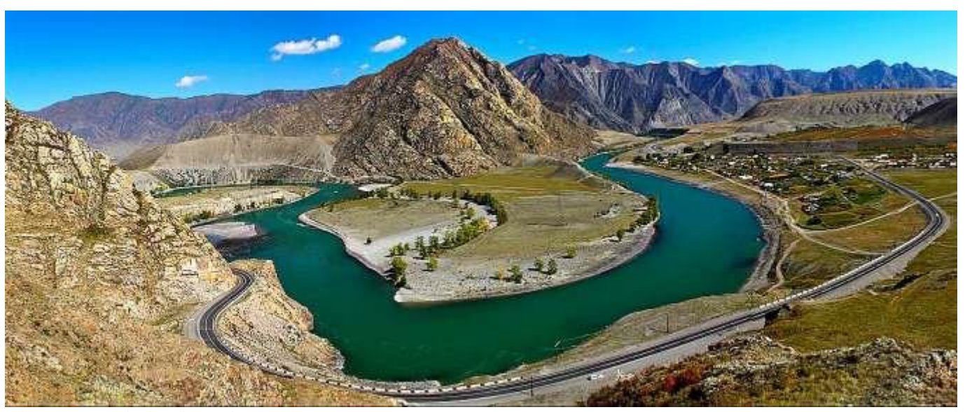
Chuya river and Chuyski road

11-days expedition (auto-trekking), Ukok plateau and Teleckoe Lake